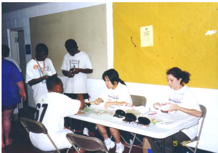
Definitely a TEAM effort to get all the Olympians registered and tested.