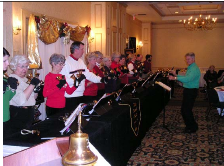
The Jubilee Ringers – from Roswell First Baptist presented a beautiful Christmas concert.